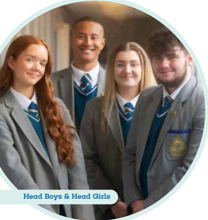
Head Boys & Head Girls

In Key Stage 3, our leadership structure for each Year Group comprises of Class Captains and Vice Captains. It includes: