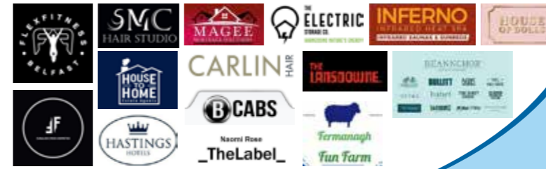
Our business partners